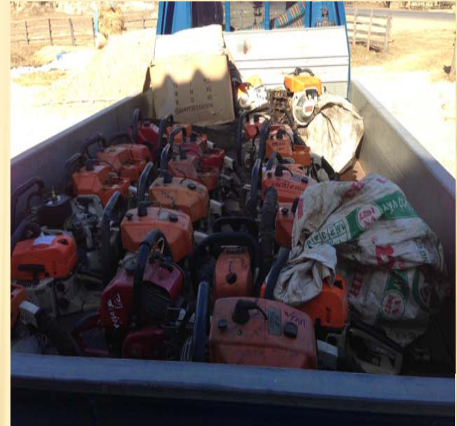
Illegal machines cutting