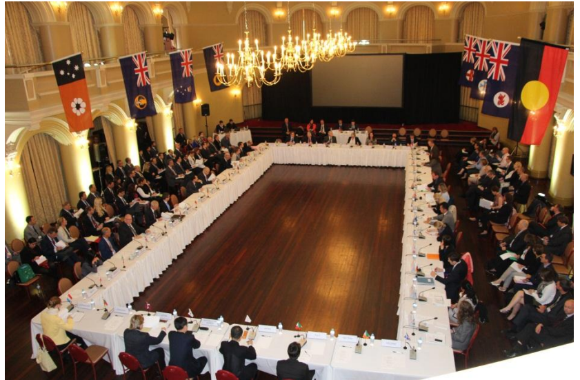
Australia Group Plenary, Perth June 2015