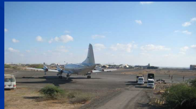
JMSDF P3-C in the Djibouti airport