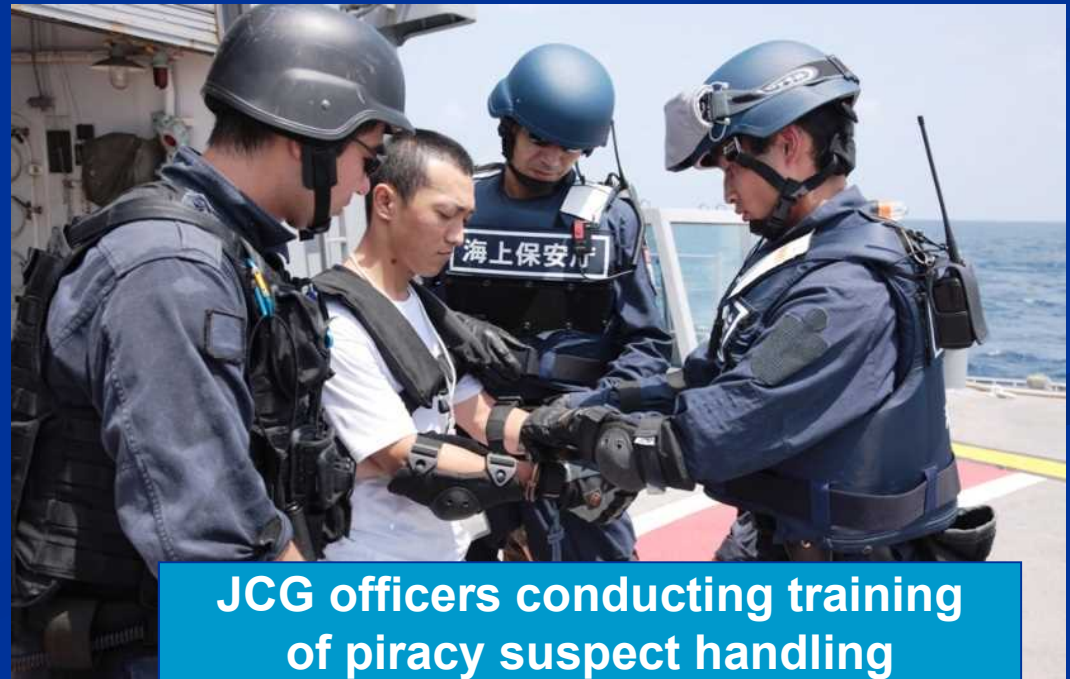
JCG officers conducting training of piracy suspect handling