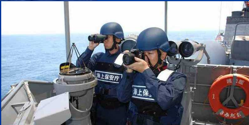
JCG officers onboard JMSDF ship