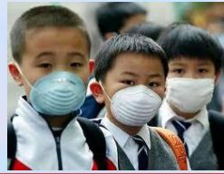
Schools Close 27 March 2003