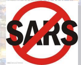
No new SARS cases 24 May 2003