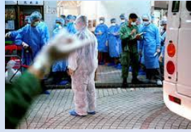
Amoy Gardens 30-31 March 2003