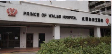
Prince of Wales H. 10 March 2003