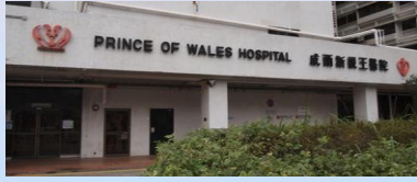
PoW Hospital Close 19 March 2003