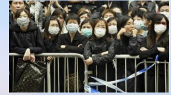
12 Deaths in 1 Day 20 April 2003