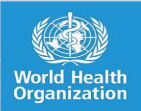
WHO worldwide alert 12 March 2003