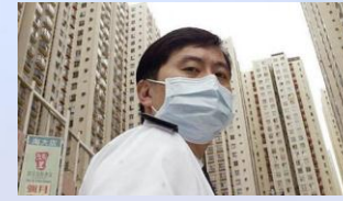
Home Confinement 2 April 2003