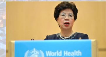
HK removed from WHO list 23 June 2003