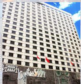
Metropole Hotel 22 February 2003