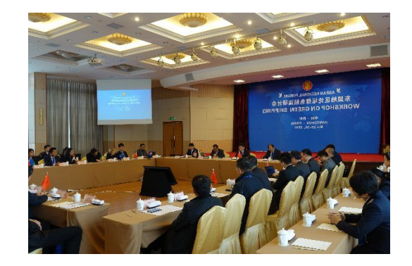
48 participants17 presentations3 major topics

Administration, Shipping Industry, Ship Building Industry, Maritime University, Classification Society, Research Institute