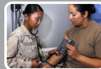
Improve Recruitment, Training, Retention