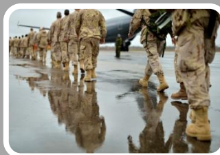
Enhance Care and Support