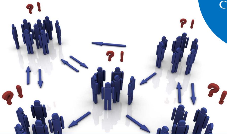
INFORMATION & INTELLIGENCE SHARING