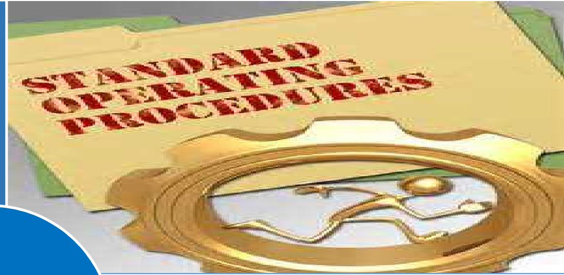
COMMON OPERATING PROCEDURES