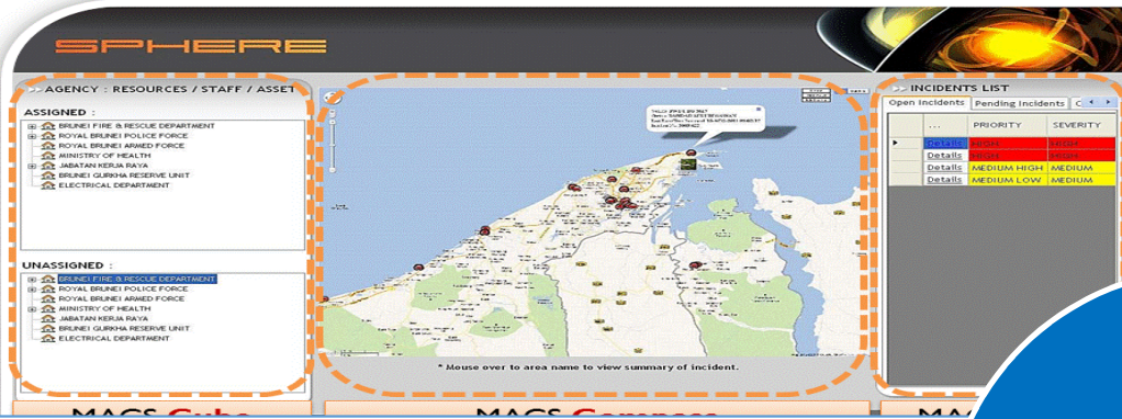
COMMON OPERATING NETWORK