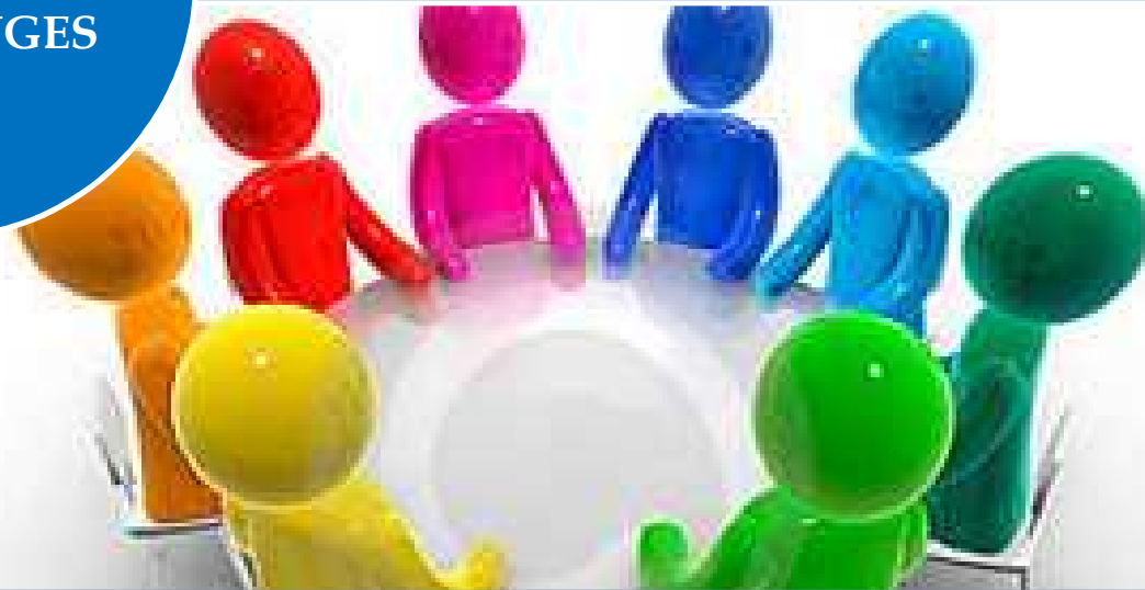
INTEGRATED PLANNING & EXECUTION