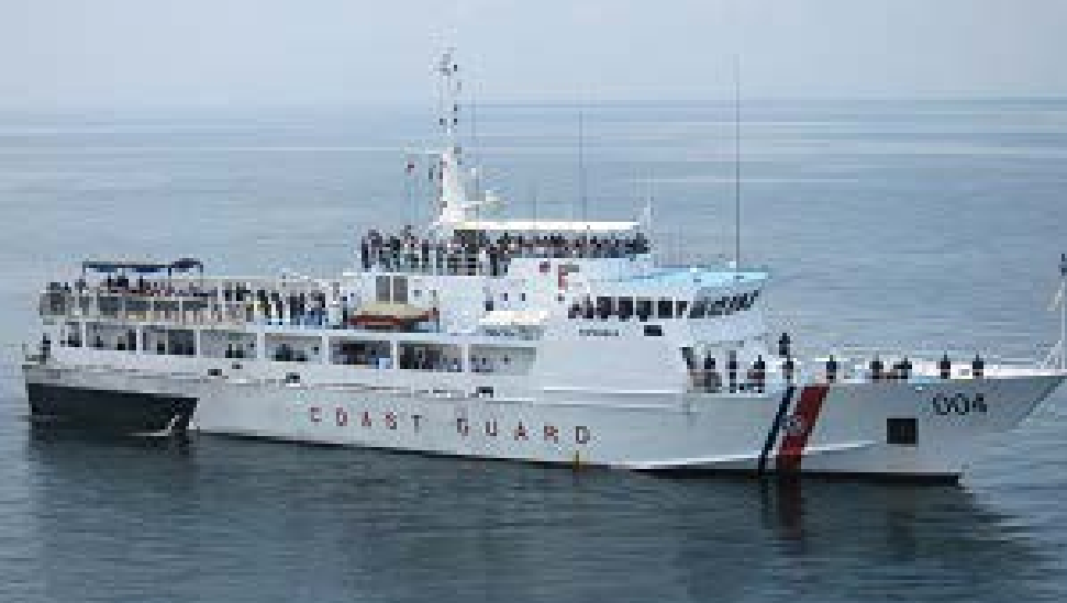
Joint Exercise: 11 th HACGAM 2015 hosted by Philippines