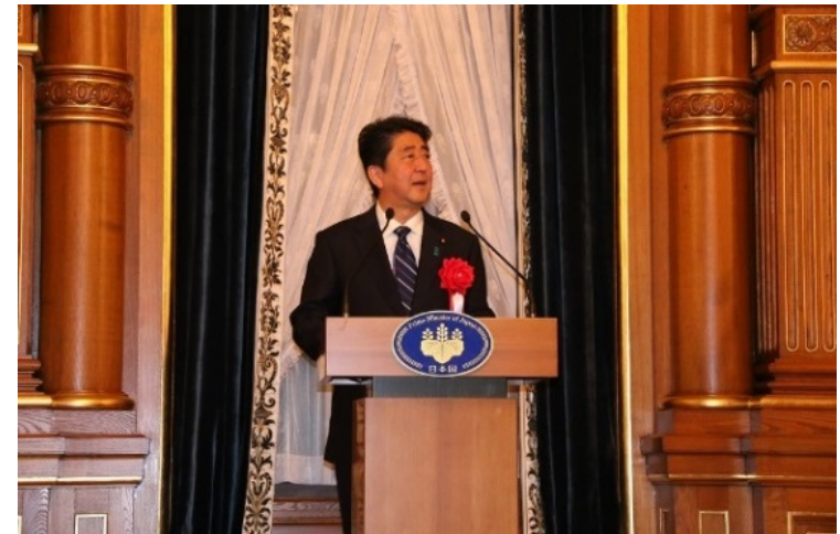
Speech by PM Abe (State Guest)