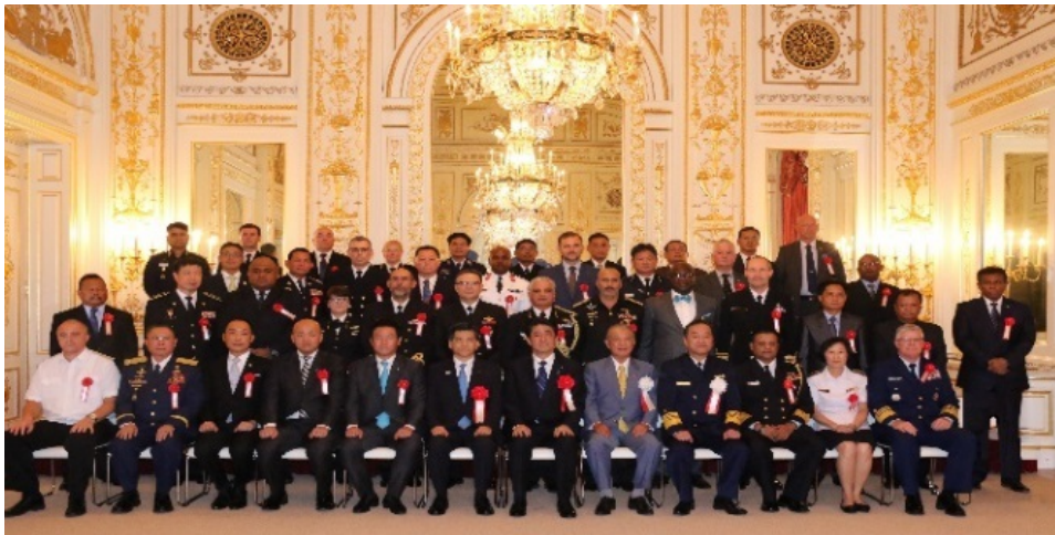
Participants and PM Abe (State Guest House)